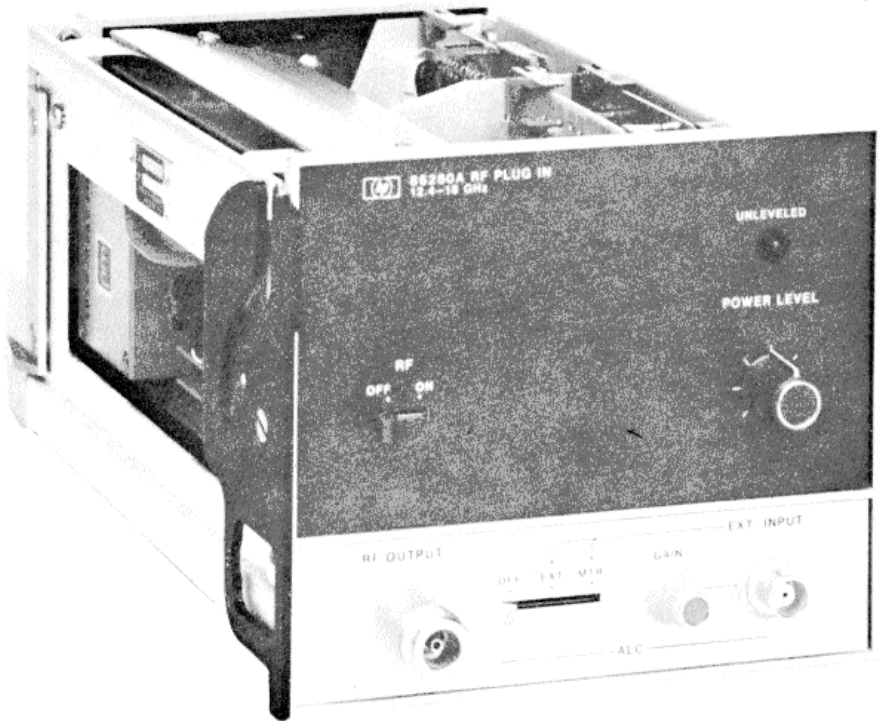
HP 86260A RF Plug-in